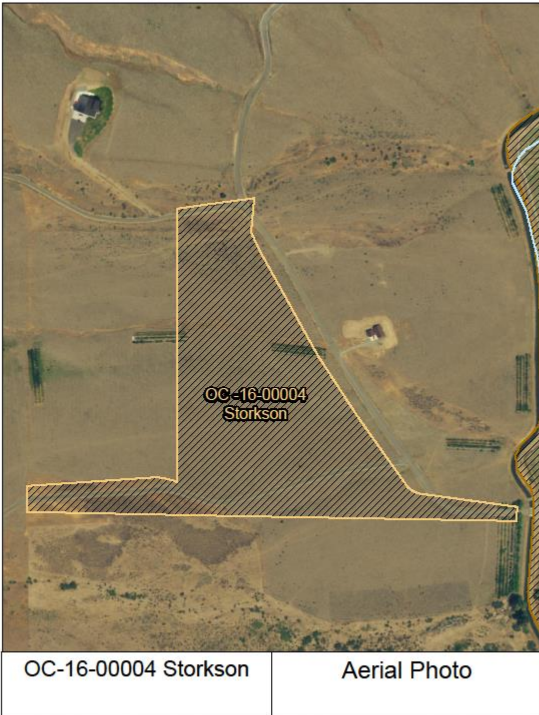
Figure 1: Aerial View of Parcel