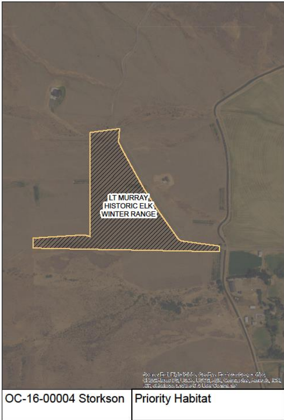
Figure 2: Priority Habit surrounding the property.