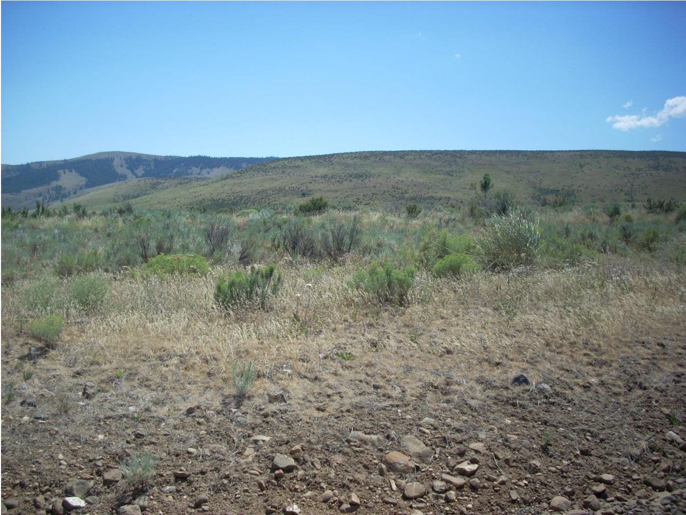
Figure 8: Sagebrush community on the Storkson land parcel.